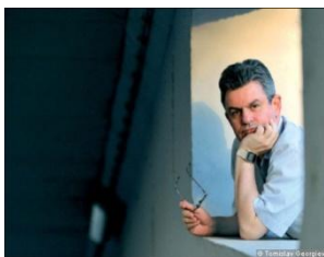
About me ( download my bio )

Online Photo Exhibition: The Old-New Face of the Narcissist - Click HERE!!!