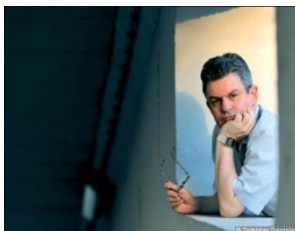
About me ( download my bio )

Online Photo Exhibition: The Old-New Face of the Narcissist - Click HERE!!!